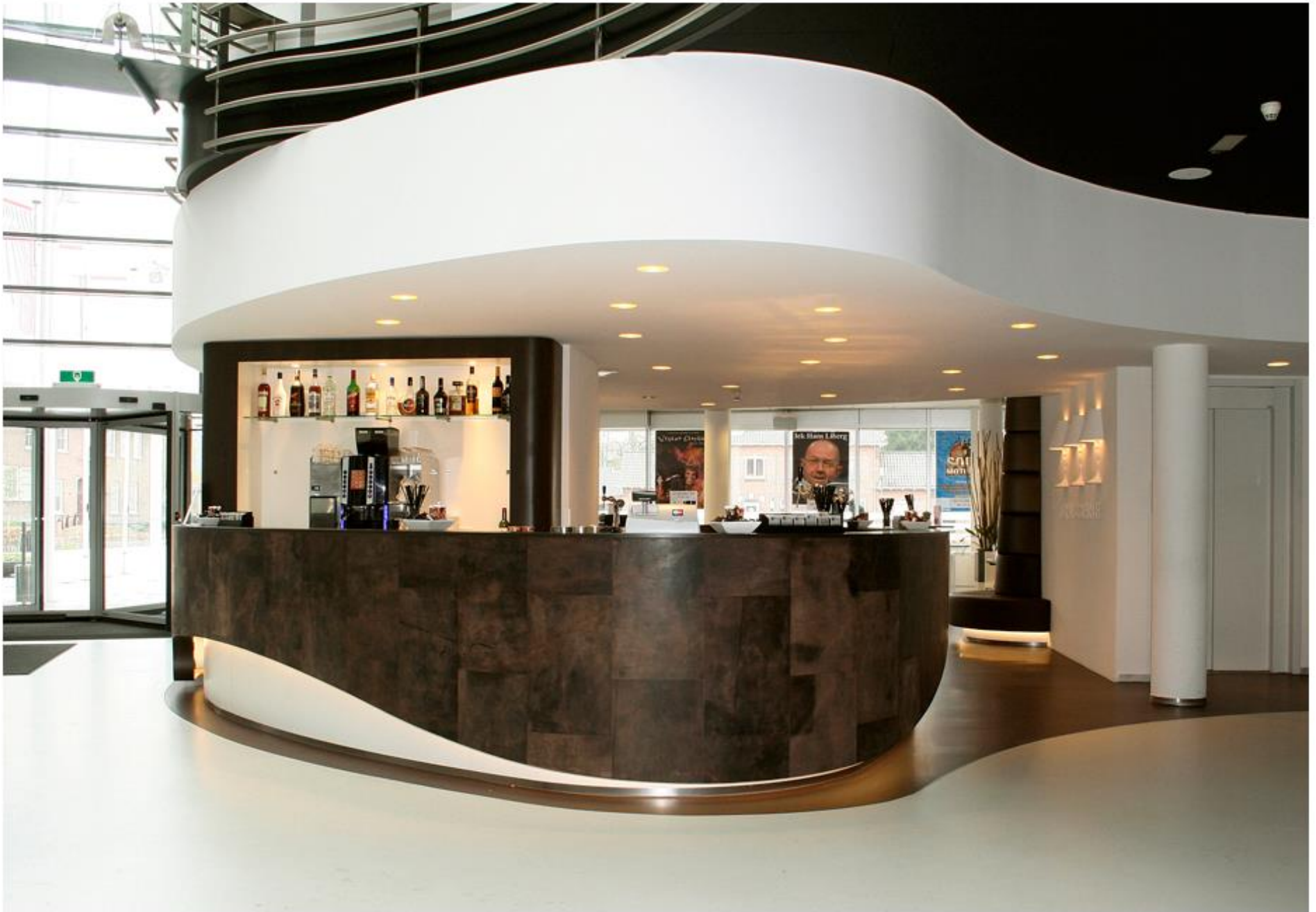
T-809 Alphenberg Leather Tile