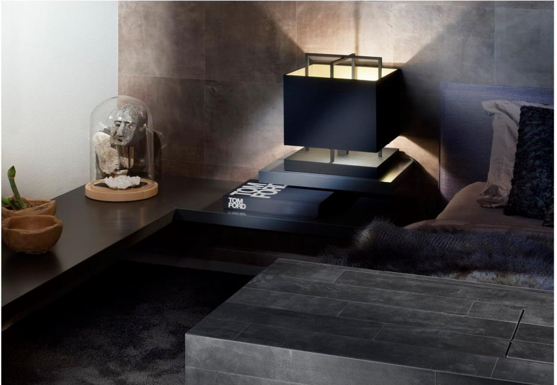
T-809 Alphenberg Leather Tile