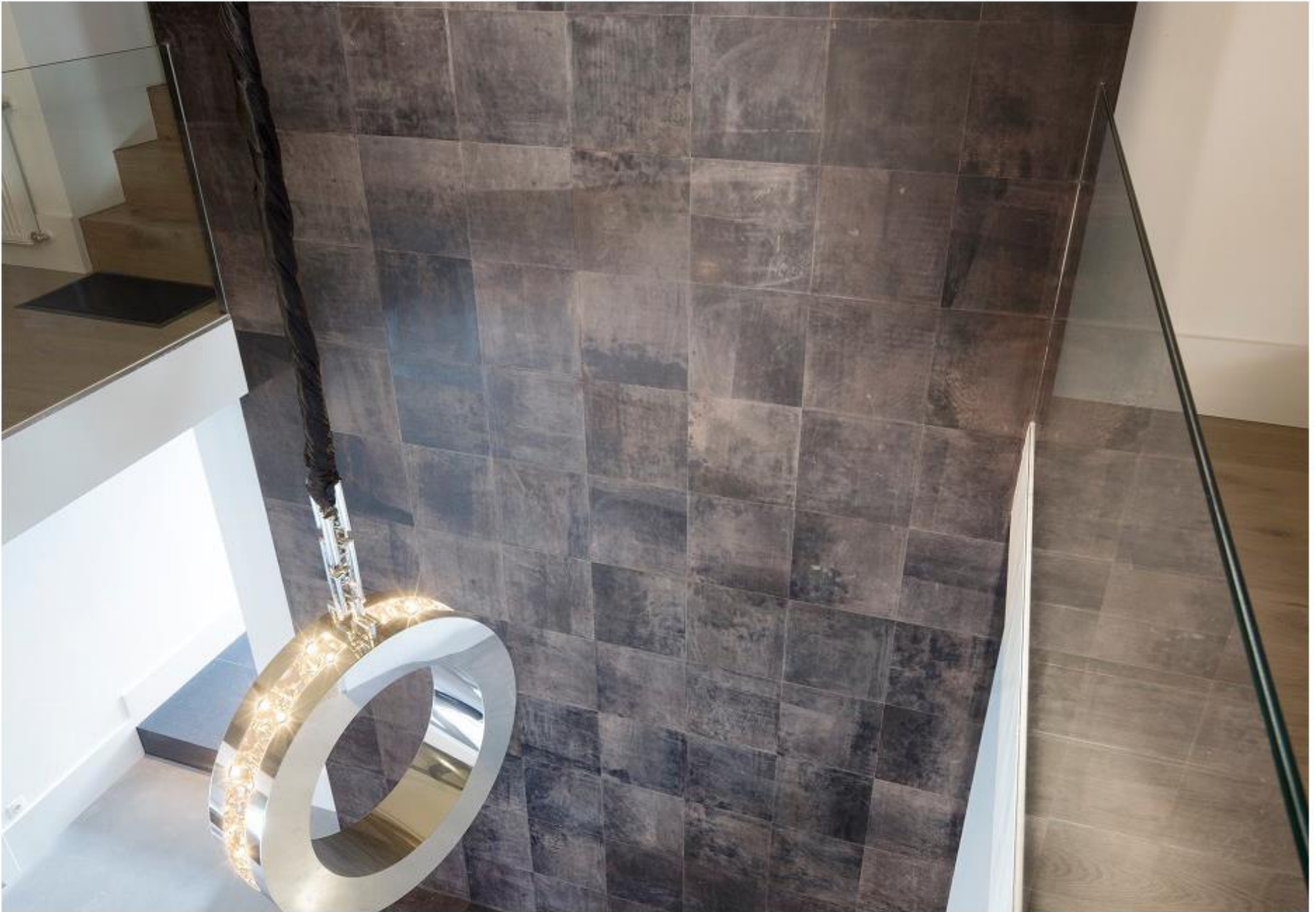
T-809 Alphenberg Leather Tile