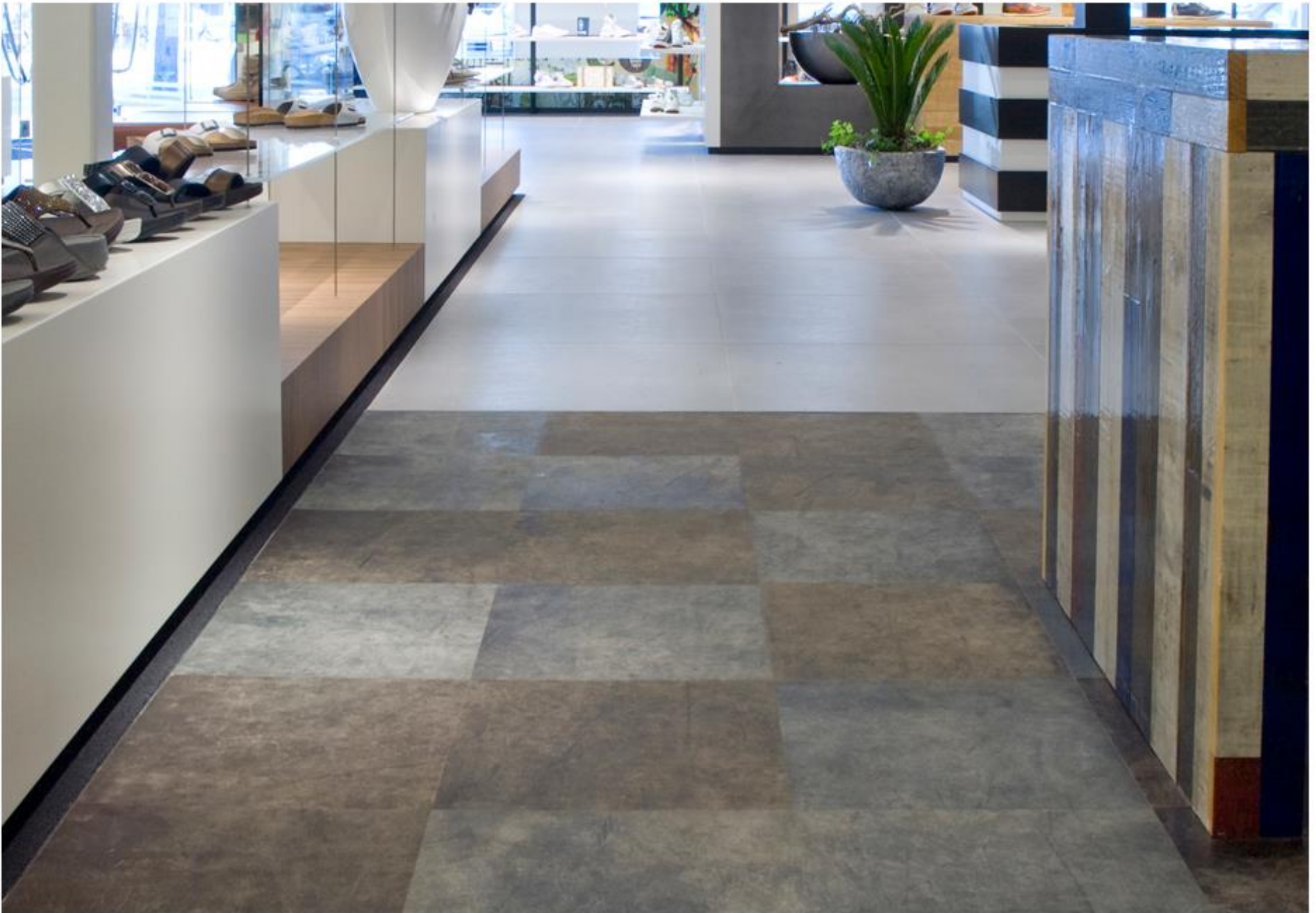
T-809 Alphenberg Leather Tile