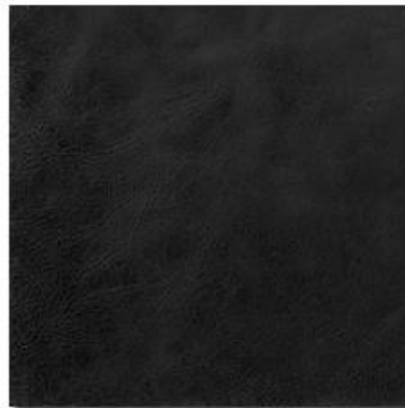
pampas pitch black