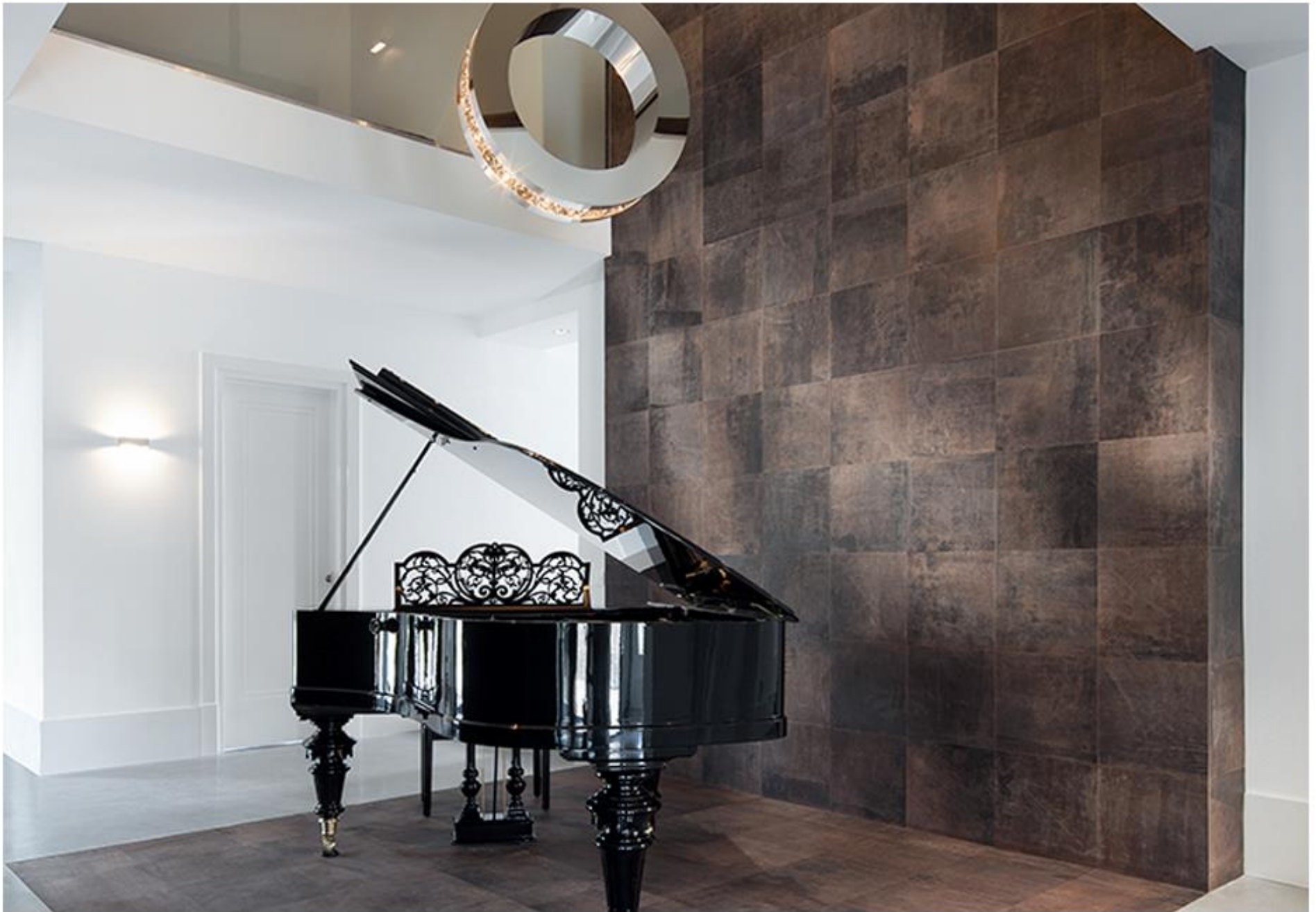
T-809 Alphenberg Leather Tile