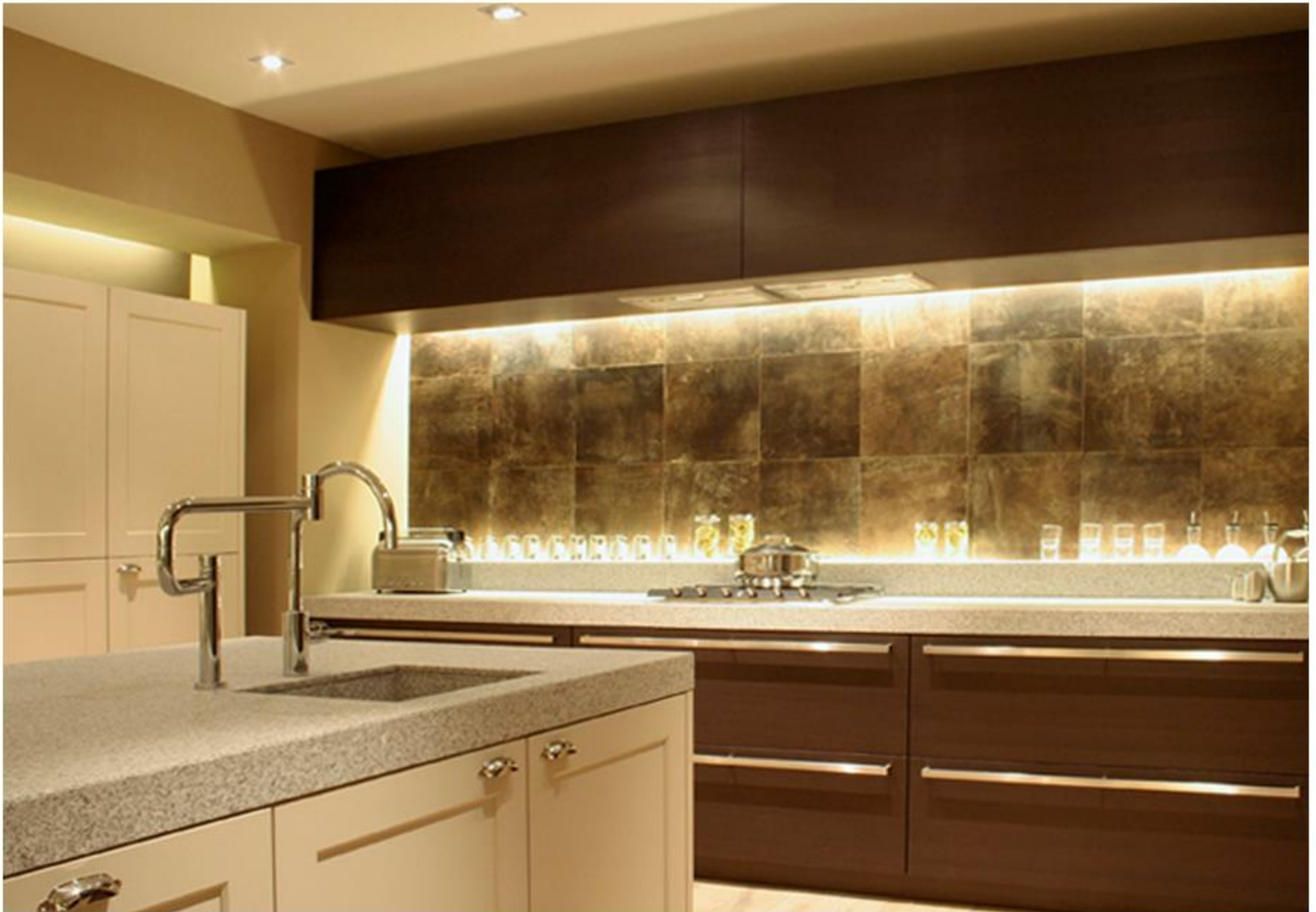
T-809 Alphenberg Leather Tile