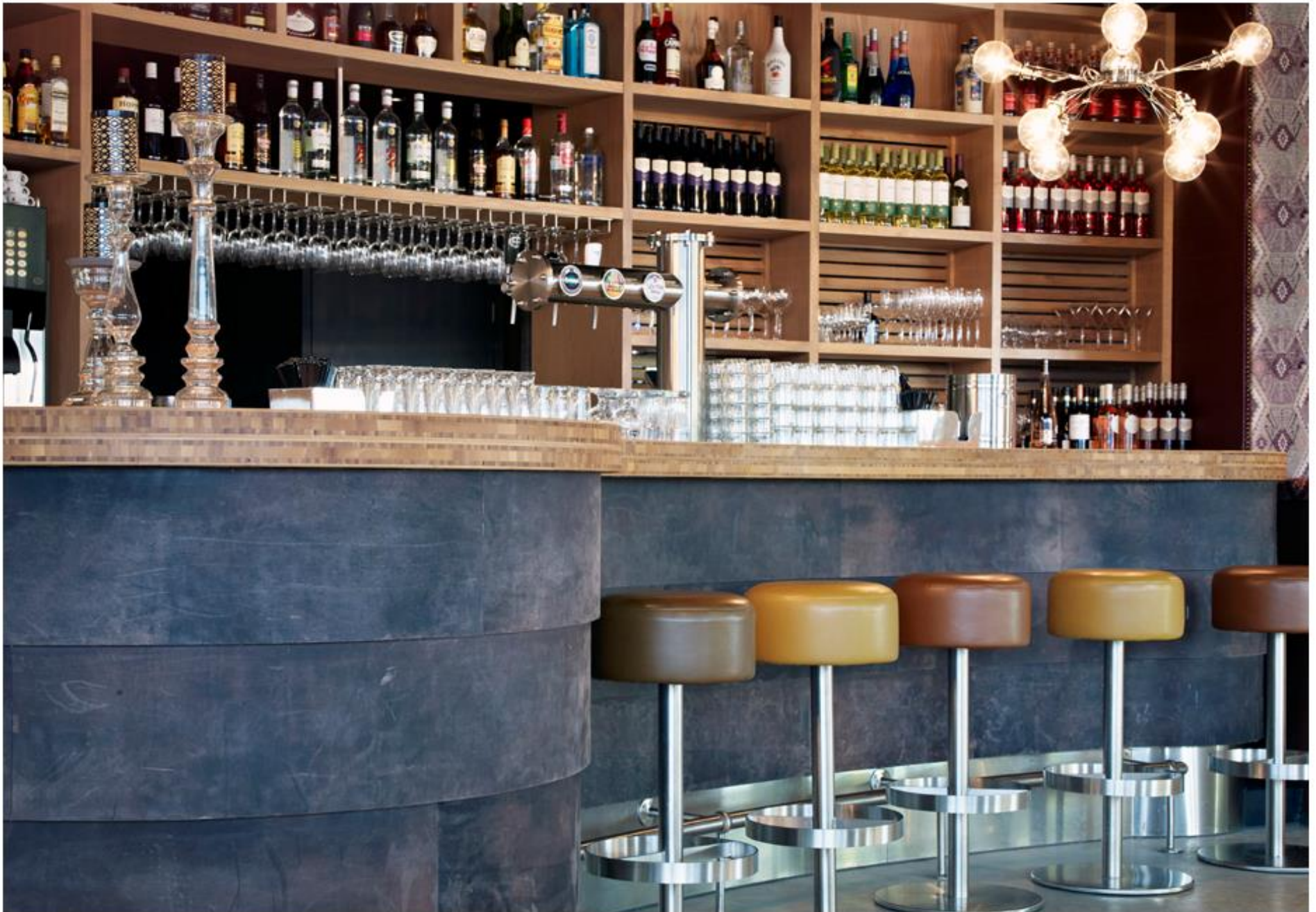
T-809 Alphenberg Leather Tile