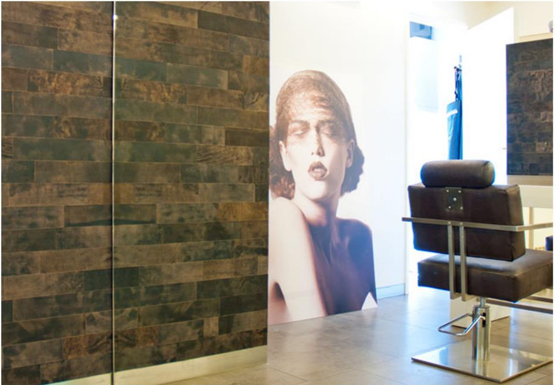
T-809 Alphenberg Leather Tile