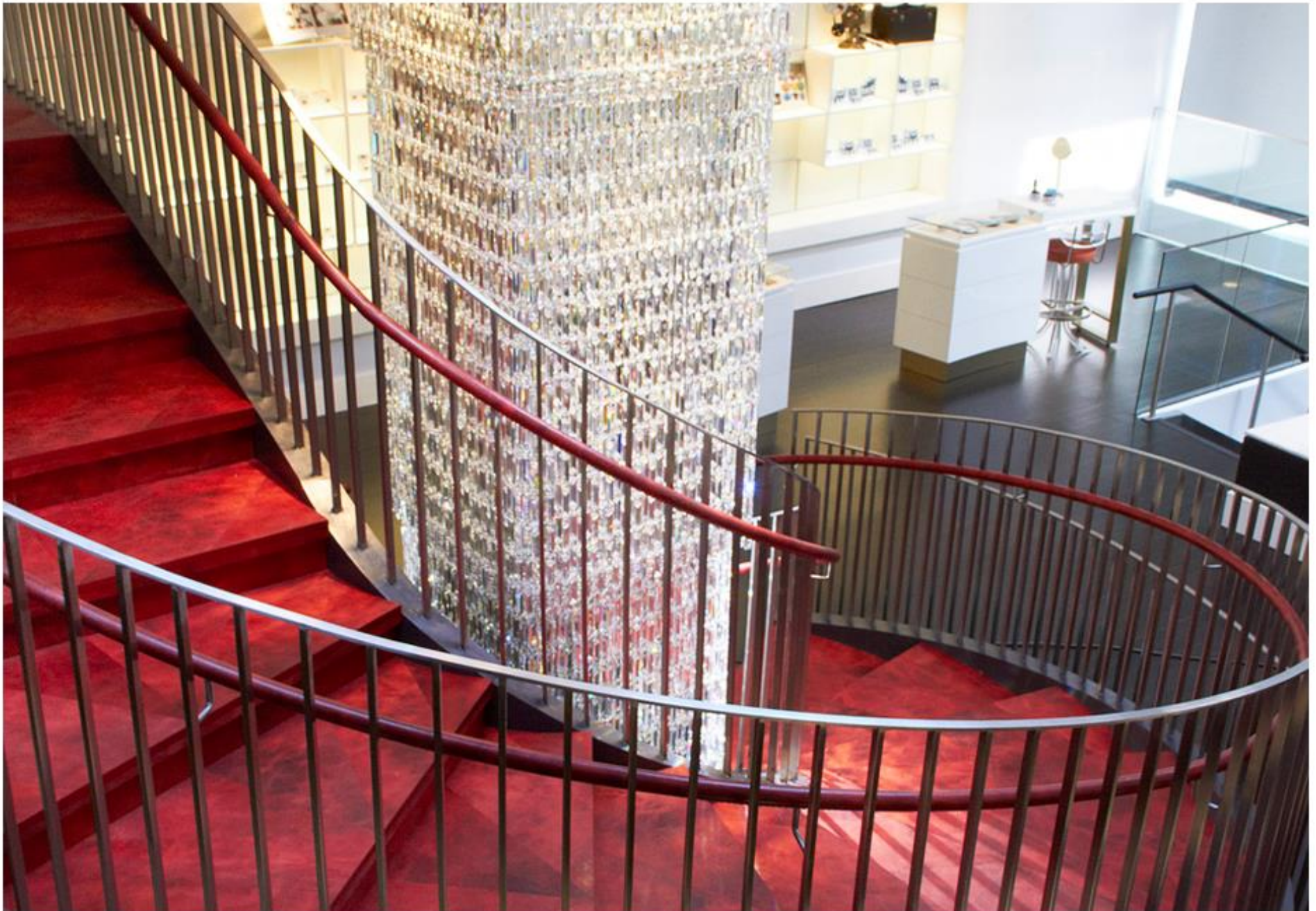
T-809 Alphenberg Leather Tile