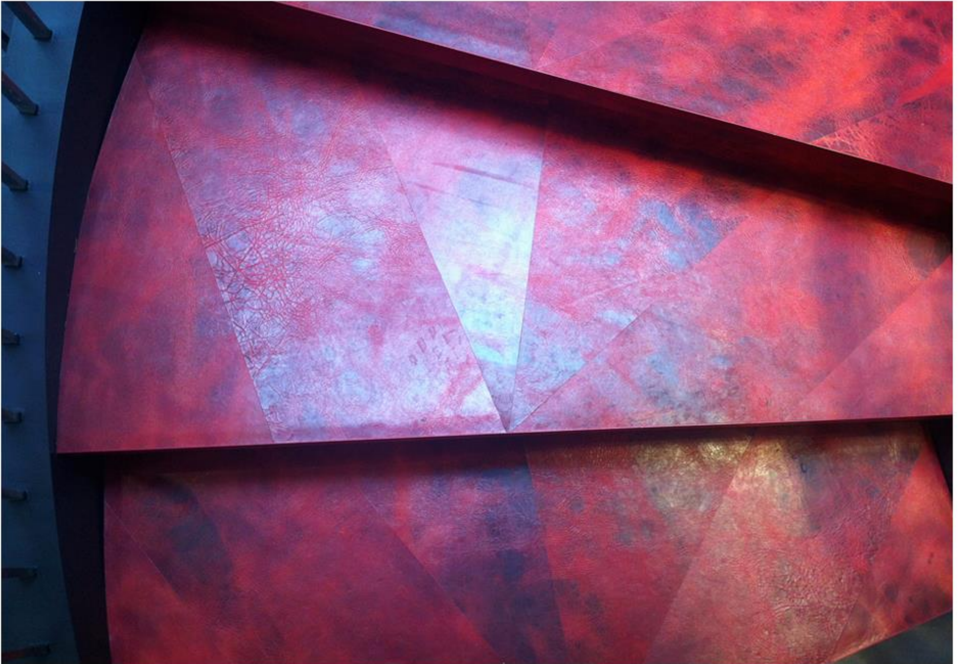
T-809 Alphenberg Leather Tile